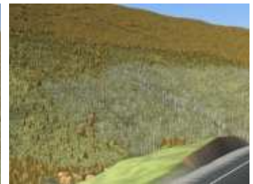
Segment C, Low Quality, 320x240 ( 2.94MB)