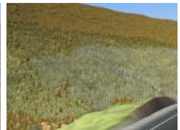
Segment C, Hi Quality, 640x480 ( 12.1MB)