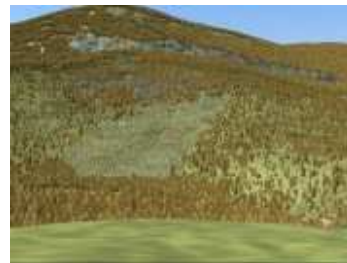
Segment B, Low Quality, 320x240 ( 2.0MB)