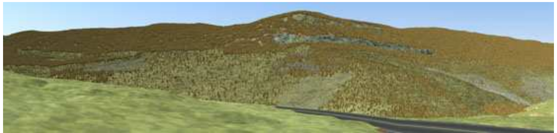
5 Year Post-Treatment

The main focus of the visualization is on the forest where existing variations in land cover must be faithfully represented both inside and outside the treatment area. An existing timber coverage was utilized for outlying areas. In the harvest units additional cruise data was available and deemed most reliable. Polygons were imported to VNS as shape files along with their timber type, height and density attributes. Additional polygons were generated in VNS to represent notable rock outcroppings which were critical to establish the correct sense of place for viewers. Highways and secondary roads were imported as shape files as well. Several temporary roads were also included in the visualization process to determine if they would be visible from key vantage points. These roads will be used in the harvesting operation.