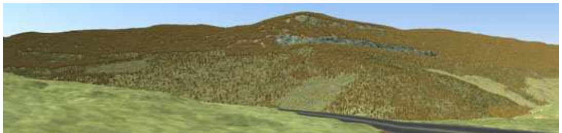
20 Year Post-Treatment

The project was undertaken in March of 2005 and completed on time in that same month. Ecosystems were created to represent the background vegetation layer. Additional ecosystems were defined for each of the harvest treatment prescriptions at both 5 and 20 year conditions. Terrafactors™ were used to depict highways, roads and temporary roads. A generalized ground texture was used for all non-treed areas in the image foreground, the intent being to avoid attracting undue attention away from the forest being studied. Detailed site photographs were used to digitize rock outcroppings in VNS, translating from perspective to plan view "on the fly." Site