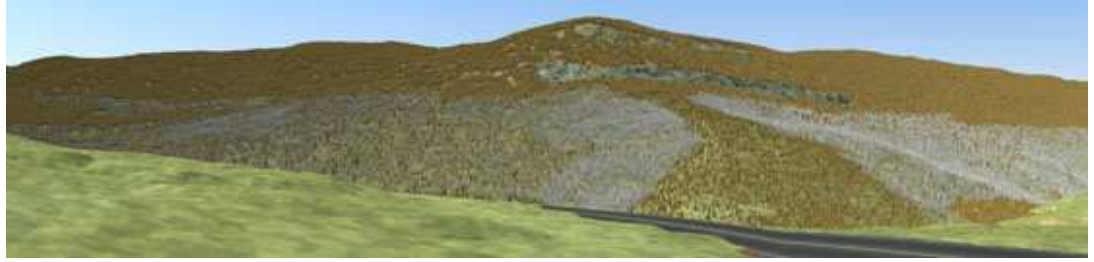
20 Year No Action Project Site

The main focus of the visualization is on the forest where existing variations in land cover must be faithfully represented both inside and outside the treatment area. An existing timber coverage was utilized for outlying areas. In the harvest units additional cruise data was available and deemed most reliable. Polygons were imported to VNS as shape files along with their timber type, height and density attributes. Additional polygons were generated in VNS to represent notable rock outcroppings which were critical to establish the correct sense of place for viewers. Highways and secondary roads were imported as shape files as well. Several temporary roads were also included in the visualization process to determine if they would be visible from key vantage points. These roads will be used in the harvesting operation.