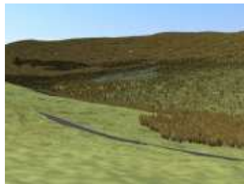
Segment A, Low Quality, 320x240 ( 2.8MB)

These videos require an MPEG-1 compatible movie player. This is a standard capability of all recent Windows and Macintosh computers. They depict a view similar to one that a person would experience traveling at 60mph along US Highway 14A. The foreground of these videos has had the detail reduced in order to highlight the forests on the distant mountainsides.