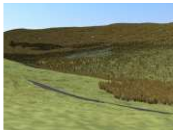
Segment A, Hi Quality, 640x480 ( 6.7MB)